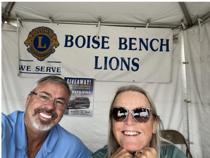
46 Lions and 9 non-Lions volunteered at the Found Kids Booth for a total of 376.5 hours. We registered 706 kids.