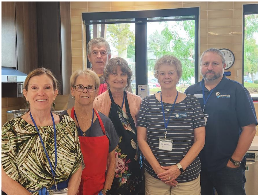
6 BB Lions made a taco bar and brownies for Ronald McDonald.