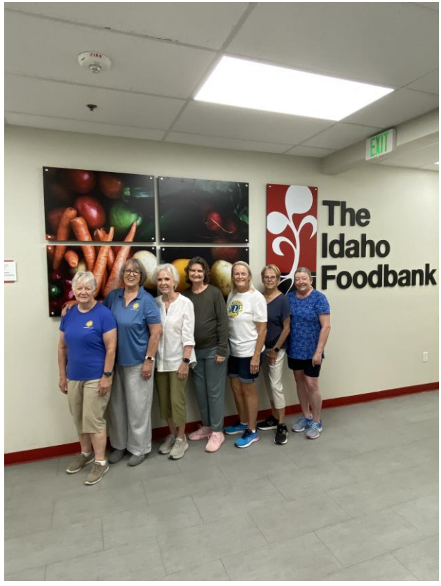
7 super lady Lions helped bag 1,800 lbs. of pinto beans and 2,500 lbs. of Roma tomatoes. The tomatoes went to the Nampa center where they were expecting around 1,000 food insecure people.