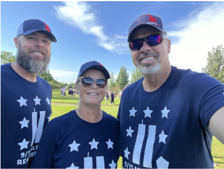
The Burks' walked with many to honor those who lost their lives from 9/11 on with Mission 43.