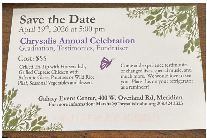
This is a wonderful event to attend and hear the testimonials of the women. The BB Lions have supported Chrysalis House for years.