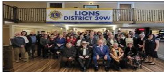
Some had already headed for home.