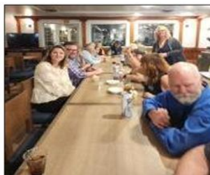
We learned a new card game.