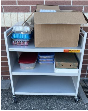
The BB Lions donated 22 dozen cupcakes for Siena Elementary's Spring Fling.