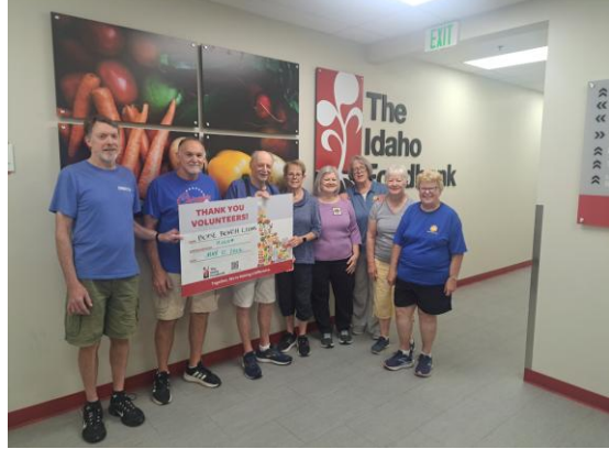
BB Lions and Henry's sons helped bag 11,000 lbs. of baker potatoes into 10 lb. bags.