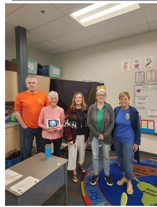
5 BB Lions screened incoming Kindergarteners for sight and hearing. 69 vision with 7 referrals, 68 hearing with 5 referrals. Thank you BB Lions!